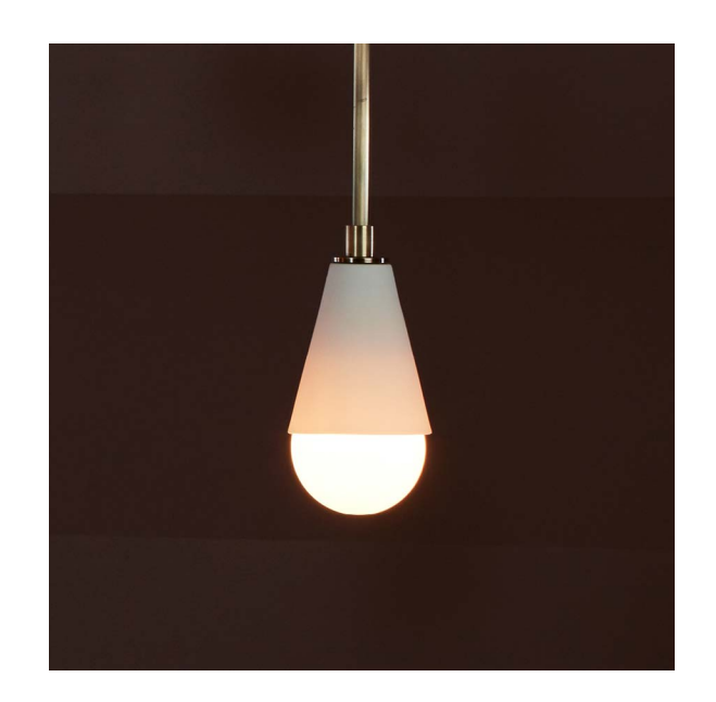
TRIAD® 1 PENDANT DRAWING ON TRIGONOMETRIC PRINCIPLES, THIS SERIES IS A STUDY IN REPEATING TRIANGULAR FORMS AND CONICAL SHAPES. AVAILABLE IN SOLID BRASS, OR WITH HAND-CAST PORCELAIN CONES THAT EMIT A DELICATE GLOW.